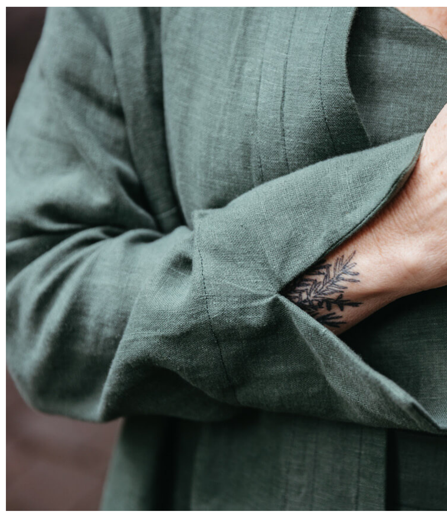
Sol made with FS All-purpose Dusty Lotus FS Signature Finish